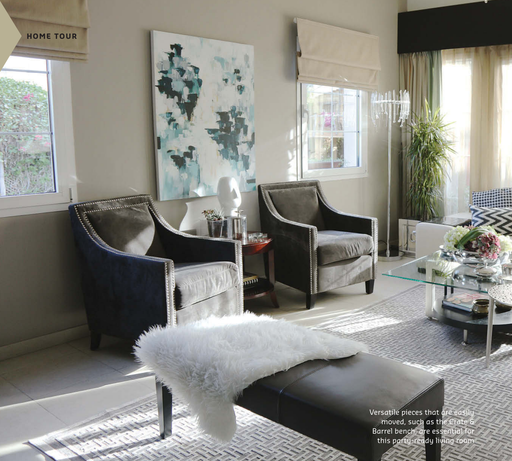
Versatile pieces that are easily moved, such as the Crate & Barrel bench, are essential for this party-ready living room