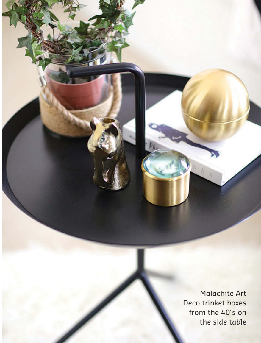
Malachite Art Deco trinket boxes from the 40's on the side table