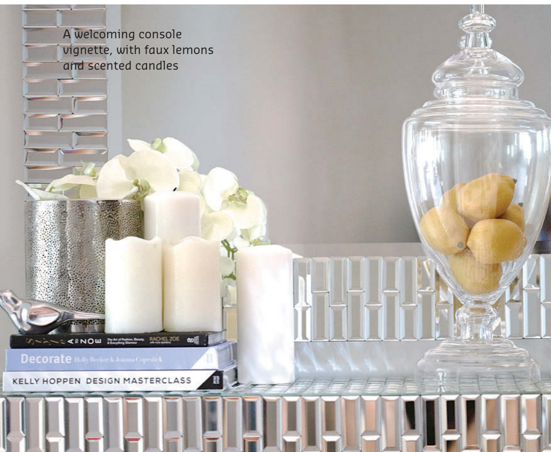
A welcoming console vignette, with faux lemons and scented candles