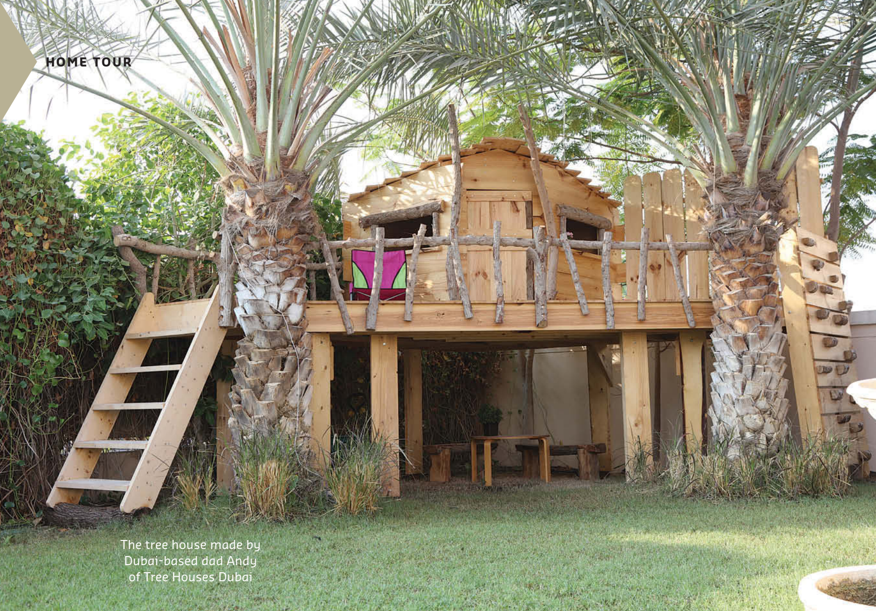
The tree house made by Dubai-based dad Andy of Tree Houses Dubai

house, even though Dubai's searing summers limit our time outdoors. But I try to spend as much time outdoors as I can, so you'll either find me lying in our hammock while the children play in the tree house, working on the outdoor table or entertaining guests over a Lebanese breakfast or barbecue."