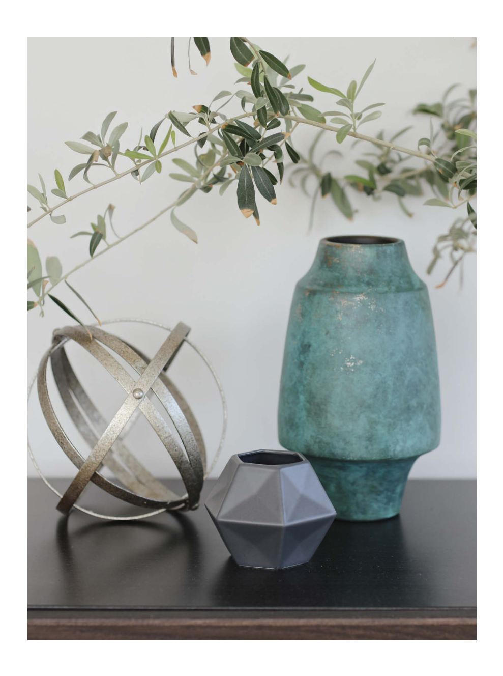
Harf Noon Design Studio creates a stylishly serene bachelor pad